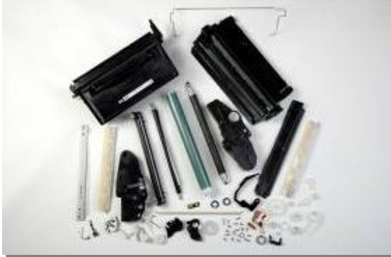
Conventional toner cartridge Contains over 60 components made from various types of metal, plastic and foam