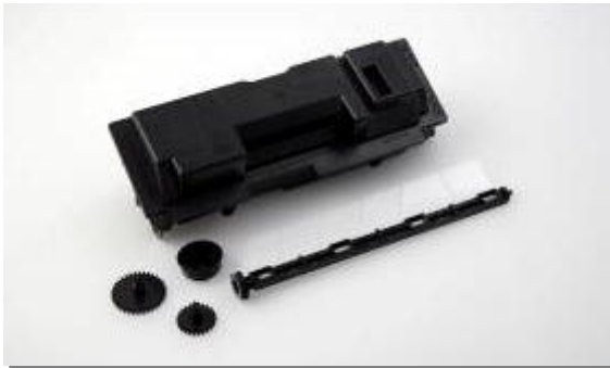
Kyocera toner cassette Contains just 5 components made from 2 types of plastic, ID coded for recycling